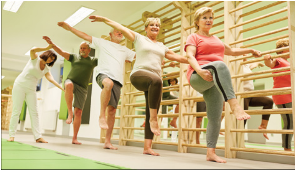
Balance exercises build strength and stability. In older adults, they help reduce the risk of falls.

Falls are one of the leading health concerns for older adults, often resulting in injuries that can limit independence and reduce quality of life. Yet many falls are preventable. With the right tools, training, and support, older Montanans can stay active, confident, and safe in their communities. That's why the Montana Arthritis and Falls Prevention Programs are committed to offering evidence-based workshops that empower participants by helping them build strength, improve balance, and reduce their risk of falling.