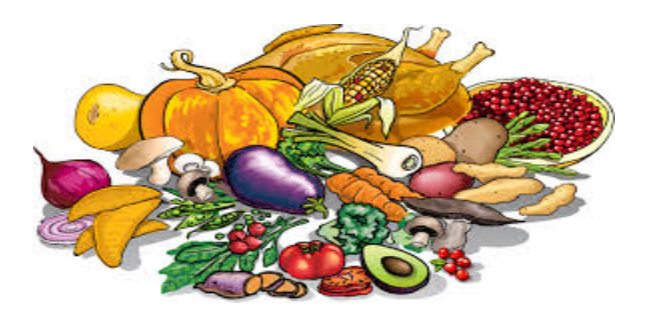
Apply for SNAP!

Supplemental Nutrition Assistance Program SNAP plays an important role in making sure that seniors receive adequate nutrition. SNAP stands for the Supplemental Nutrition Assistance Program and provides seniors with extra money for groceries each month. The average benefit for a senior in Montana is $137 but even the minimum benefit amount of $16 adds up.