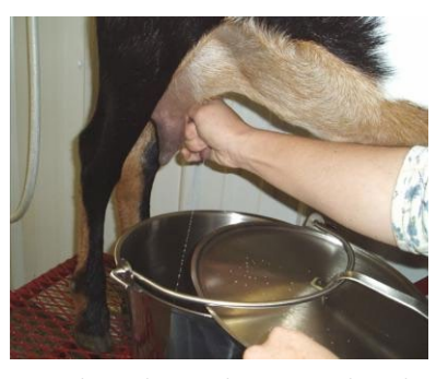
Use clean, dry, single-use towels and covered pails.