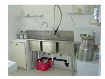
Milk processing facilities need to be easy to clean and dedicated to milk processing only.