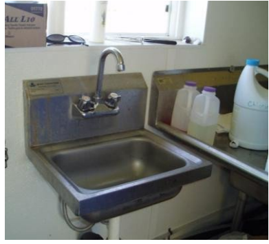
Self-closing doors and separate hand-washing sinks reduce the risk of contamination.

Milk containers and other utensils should: