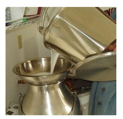
Stainless steel is a common material for dairy equipment.