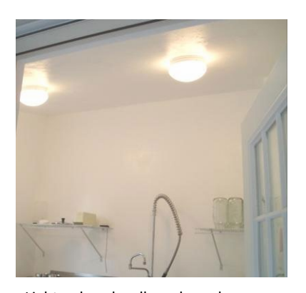
Light-colored walls and good lighting make it easier to see "dirt" that could contaminate your product.

Remember: Bare or unfinished wood encourages bacteria survival and growth.