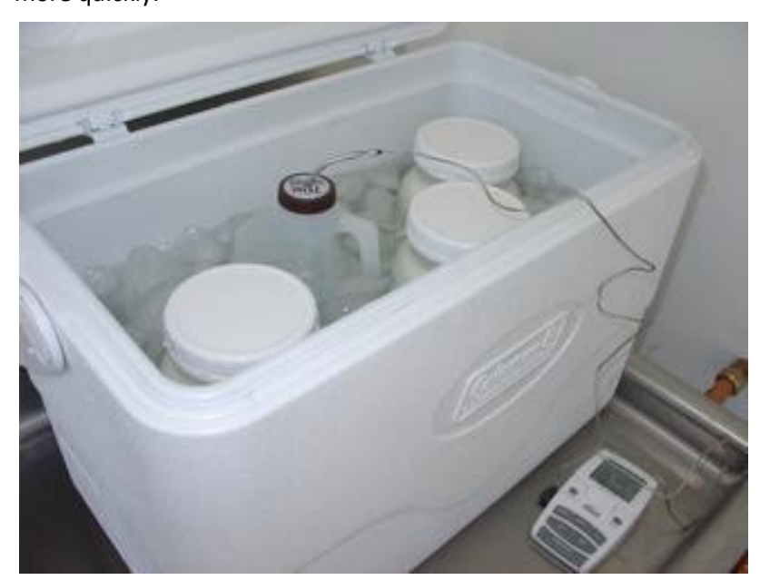
Monitor temperatures to assure effective cooling.

The most efficient way of achieving quick cooling of the milk is by using a water or ice bath. Do not plan on using refrigeration as your main cooling method; it takes too long and may never reach temperatures low enough. Effective agitation of the milk will also assist in reaching the cooling recommendations. Using smaller containers such as half gallons will cool more quickly.