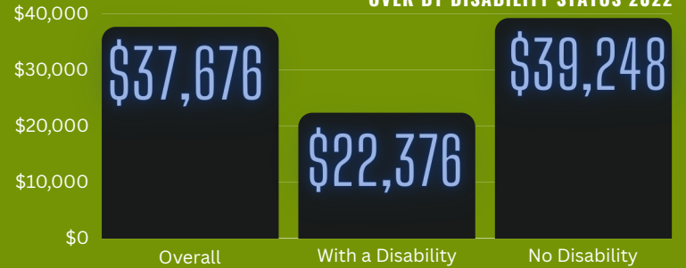
FIGURE 2: MEDIAN EARNINGS FOR MONTANA WORKERS 16 AND OVER BY DISABILITY STATUS 2022

In 2022, nearly 25% of Montanans with disabilities (19,180 people) had income in the past 12 months that was at or below the poverty level, compared to 9.8% for Montanans without disabilities. This represents over double the rate of poverty for Montanans with disabilities. As such, the population with disabilities makes up about 26% of the population at or below poverty levels, despite representing 12% of the population 18 to 64.