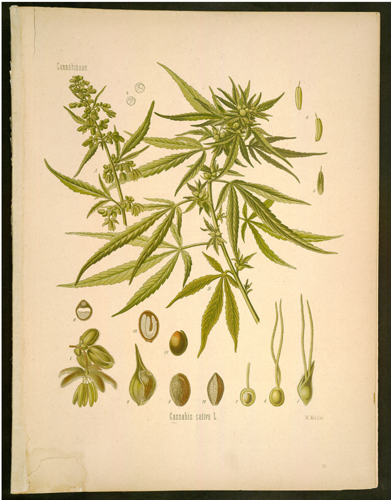
Figure 1. Cannabis Sativa plant.