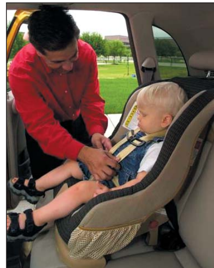
Buckle children in safety seats and wear a seat belt every time you drive or ride in a motor vehicle to reduce the incidence of TBI.