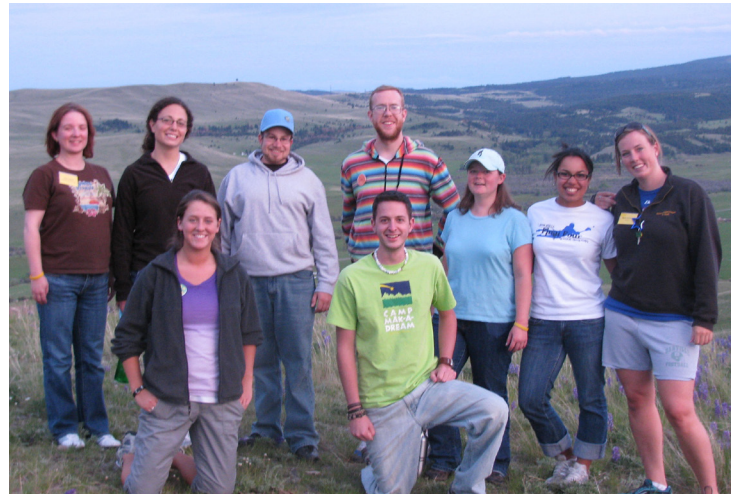
Camp Mak-A-Dream Young Adult Survivors Camp

Camp Mak-A-Dream is celebrating their 15th anniversary this year! Camp Make-A-Dream serves kids as young as six in age specific programs, where they can discuss their challenges and frustrations openly and honestly. Camp Mak-A-Dream also hosts retreats for adult women into their 80's who are either currently undergoing or have completed treatment for cancer. This season, Camp Mak-A-Dream has offered ten cost-free programs for children, young adults, and families affected by cancer and served approximately 300 families.