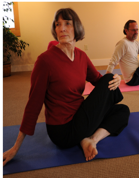
Recovery Yoga classes at the Cancer Support Community

The Wellness Community Montana is now called Cancer Support Community Montana, after merging with Gilda's Club Worldwide. With a new facility located in Bozeman, the Cancer Support Community Montana offers over 50 programs per month which includes support groups, education, art therapy, yoga, QiGong, Guided Imagery, family programming, cooking classes, nutrition education, exercise opportunities, and a Wig Center where volunteer cosmetologists trim wigs and help tie scarves.