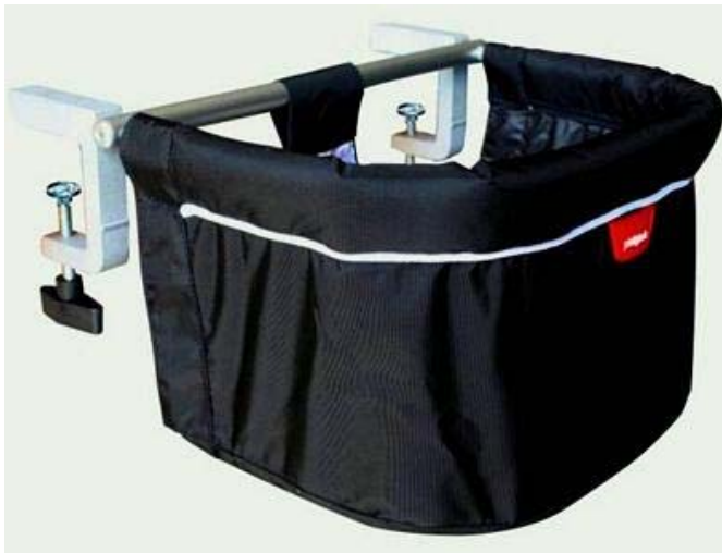
Metoo chair with rubber clamp pads on the undersides of the metal clamps.