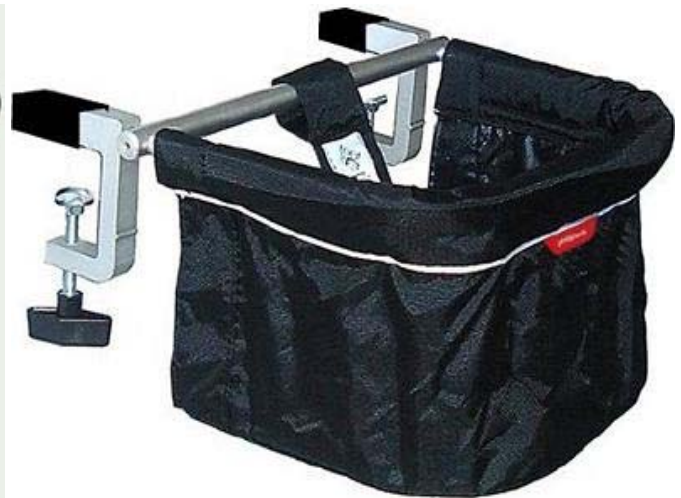
Metoo chair with rubber boots covering the tops of the metal clamps.