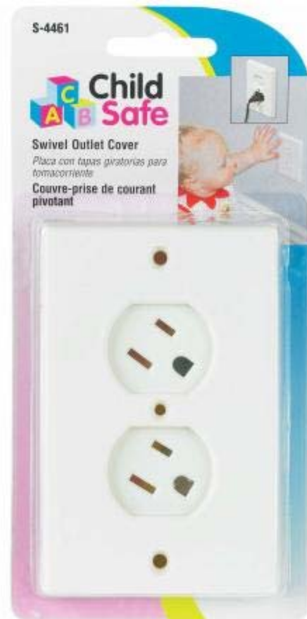
Cabinet and Drawer Latches and Outlet Covers in packaging